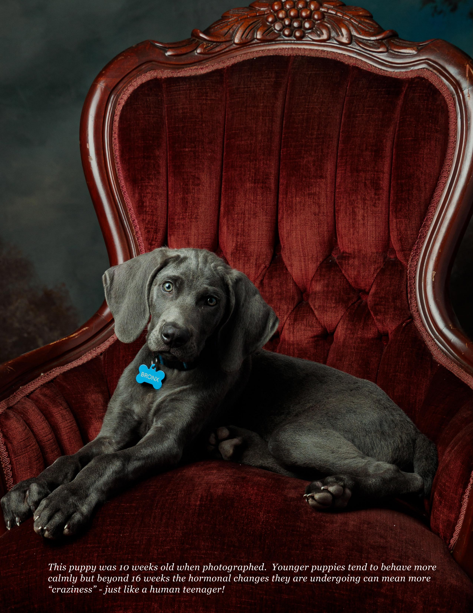
This puppy was 10 weeks old when photographed. Younger puppies tend to behave more calmly but beyond 16 weeks the hormonal changes they are undergoing can mean more “craziness” - just like a human teenager!